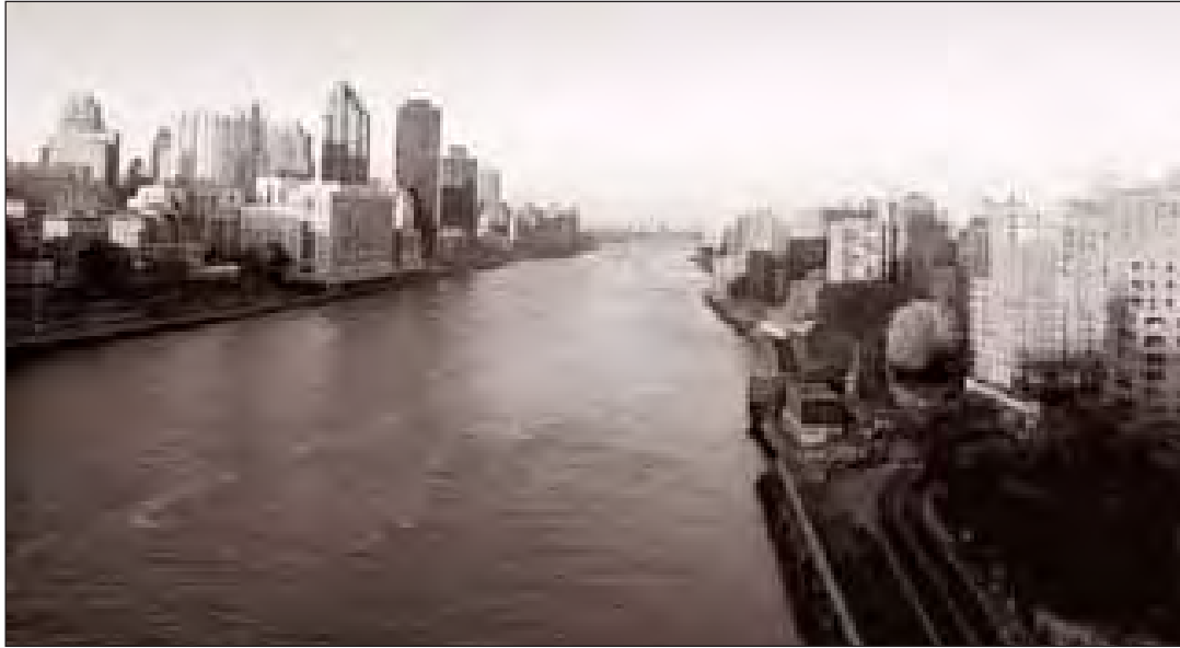
Aerial view of Roosevelt Island looking north.

Kahn’s imagination was indeed fertilized by his love of Classical ruins, and although completely modern in his architectural approach, he never abandoned the principles of symmetry and geometrical order derived from his education in the Beaux-Arts neoclassical tradition. But the model of the FDR Memorial shows something else besides a sensibility attuned to Greek temple architecture. The part that is a garden recalls the brilliant spatial geometries of André Le Nôtre,