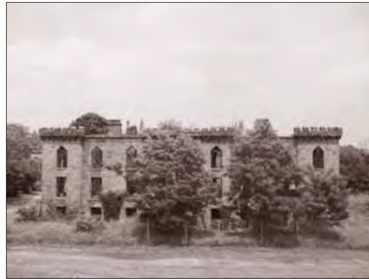
Ruins of former smallpox hospital, designed by James Renwick, Jr., 1856.

apartment houses, and a park on a section of Hudson River shoreline that had been augmented with landfill derived from the construction of the World Trade Center in Lower Manhattan. A year later the city signed a ninety-nine-year lease with the state, creating the Welfare Island Development Corporation to build and subsequently manage a planned community on Welfare, soon-to-be Roosevelt, Island.