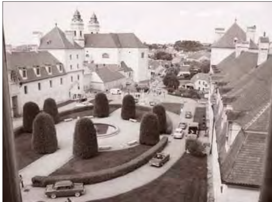
Antique car show, Valtice Chateau forecourt, May 2010.

At the time of the rediscovery of the Lednice-Valtice castles by various heritage-protection organizations two years later, however, some of the estate's most picturesque