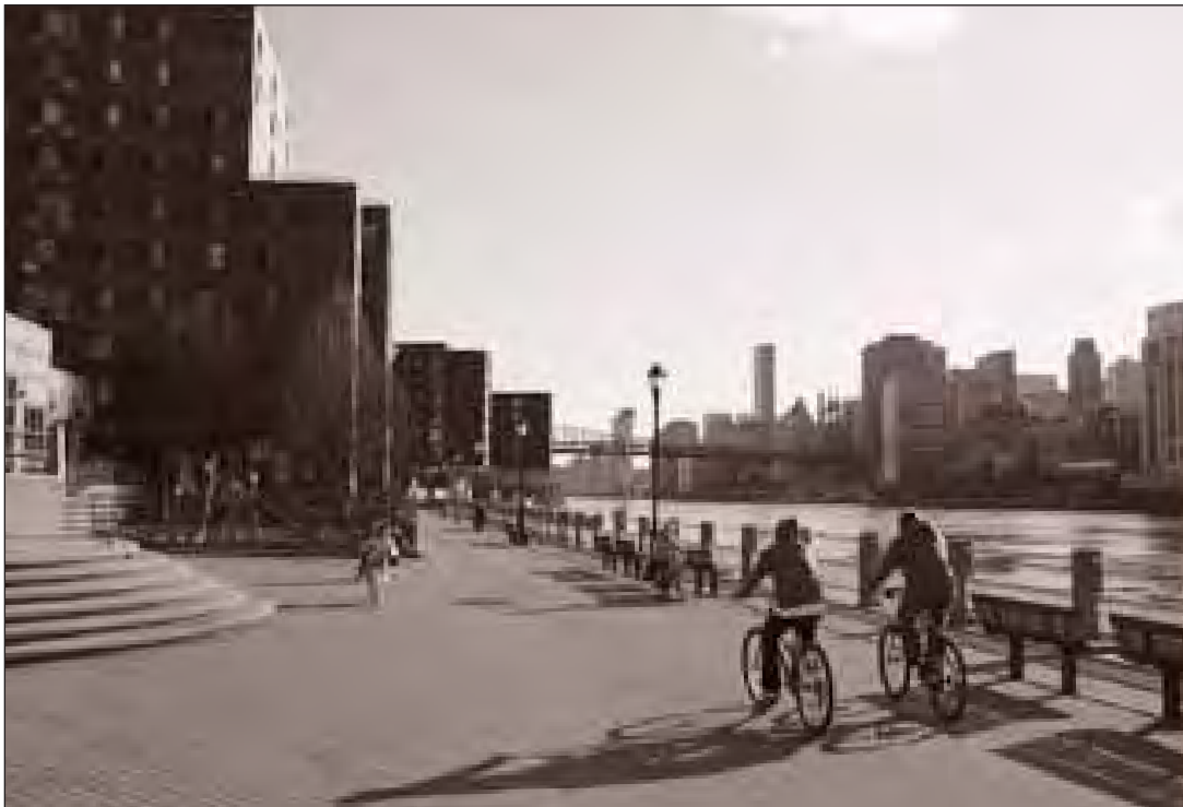
Roosevelt Island promenade.