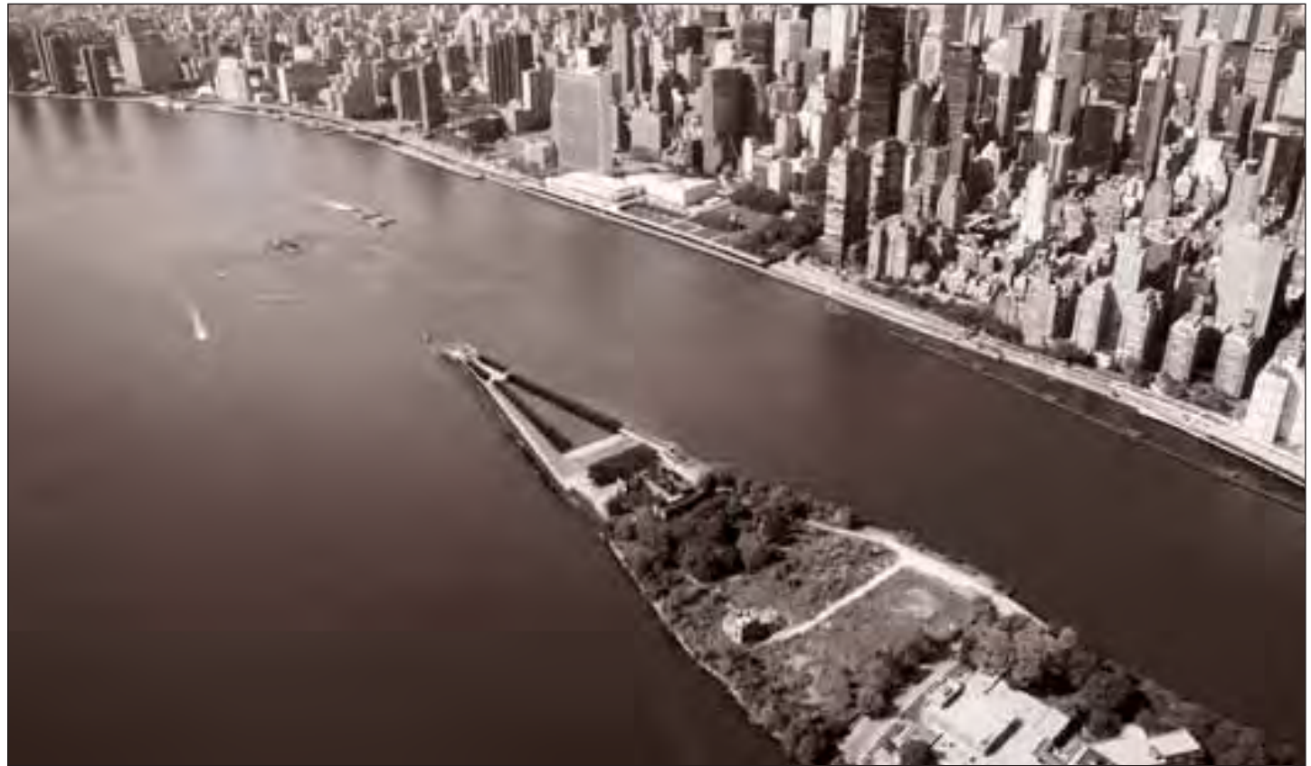
Southern end of Roosevelt Island depicting the future monument by Louis I. Kahn.