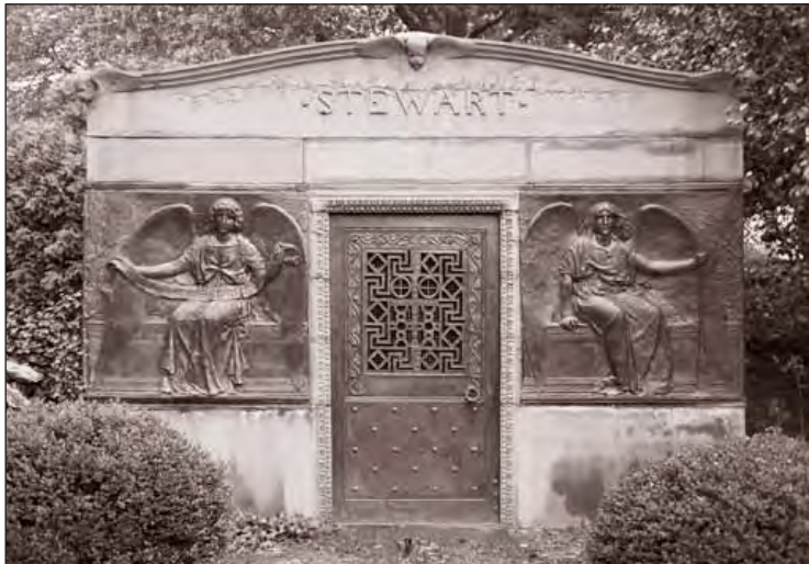
Stewart Mausoleum, Green-Wood Cemetery, Brooklyn, New York.

America's growing ethnic and religious diversity meant that different communities created very different cemeteries. Even as lawn-park cemeteries emulated urban parks, small cemeteries for Catholic Italians and Poles or Russian Jews maintained the tradition of individual markers tightly lined up in sparse natural spaces. The remnants of fenced graves, iron crosses, and small gravestones in the campo santo churchyards of the Southwest are vernacular expressions of the importance of family relationships beyond the grave. Ceramic photographs grace some markers, enforcing a heightened form of remembrance and intimacy between the living and the dead.