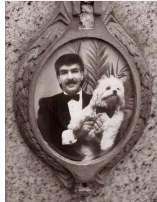
Grave marker with ceramic portrait, Green-Wood cemetery, Brooklyn, New York.

Memorial parks tended to be more like other twentieth-century consumer businesses, focused on profits although still structured as nonprofit organizations. Their management also exerted ever greater control over the landscape, replacing upright individual gravestones and family monuments with markers flush to the ground. Very elaborate memorials were still erected, but these reflected institutional values such as patriotism, family, and religion, rather than commemorating individuals or families. As a result the memorial park took on the appearance of a vast lawn punctuated here and there with monuments of a generic nature such as a statue of Christ, an eagle, or a Masonic emblem. The number of plantings declined dramatically as the landscape was simplified to trees and lawns, with an occasional flower bed, and individual vases on the graves.