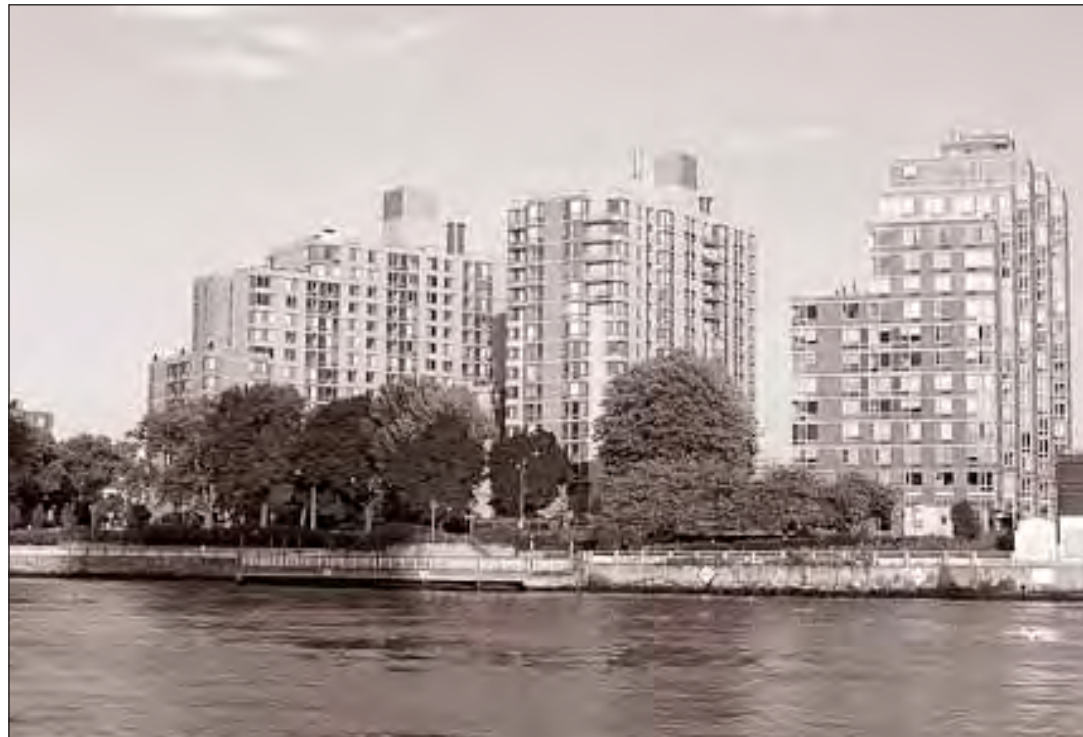
Roosevelt Island, contemporary view from the East River.

The 1960s and 70s were confidently utopian decades when such terms as "master planning," "urban renewal," and "slum clearance" had not yet fallen into disrepute.