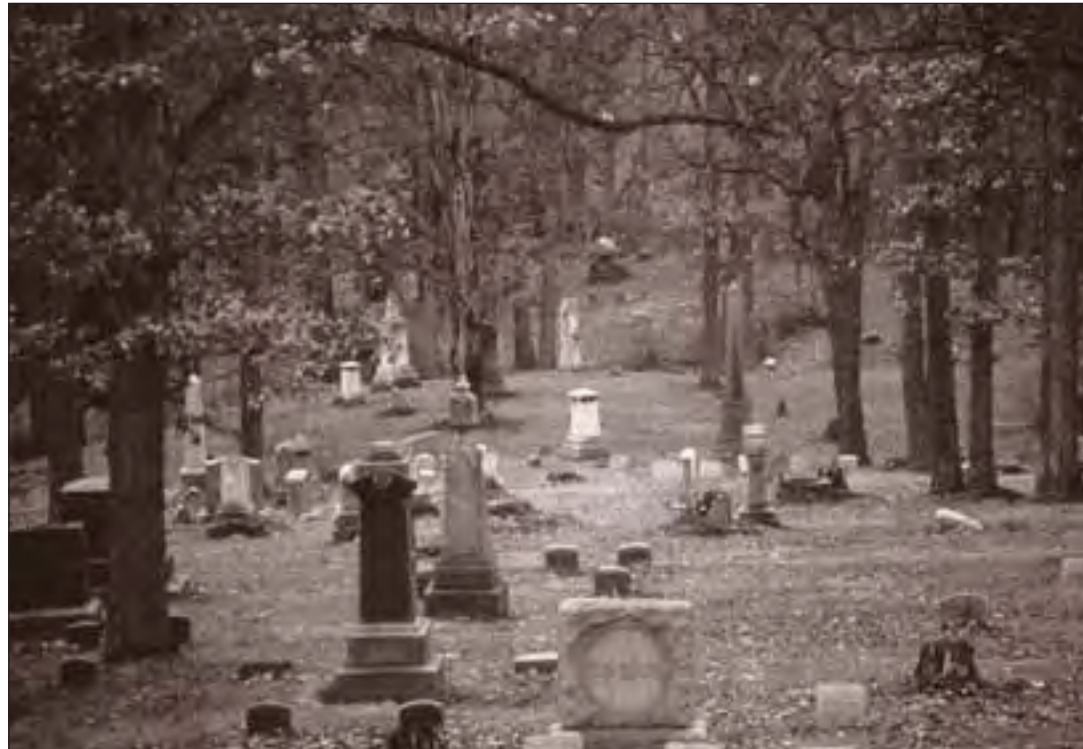
Nature envelops the visitor. Oakwood Cemetery, Syracuse NY.